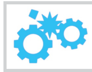
MACHINE DOWN TIME